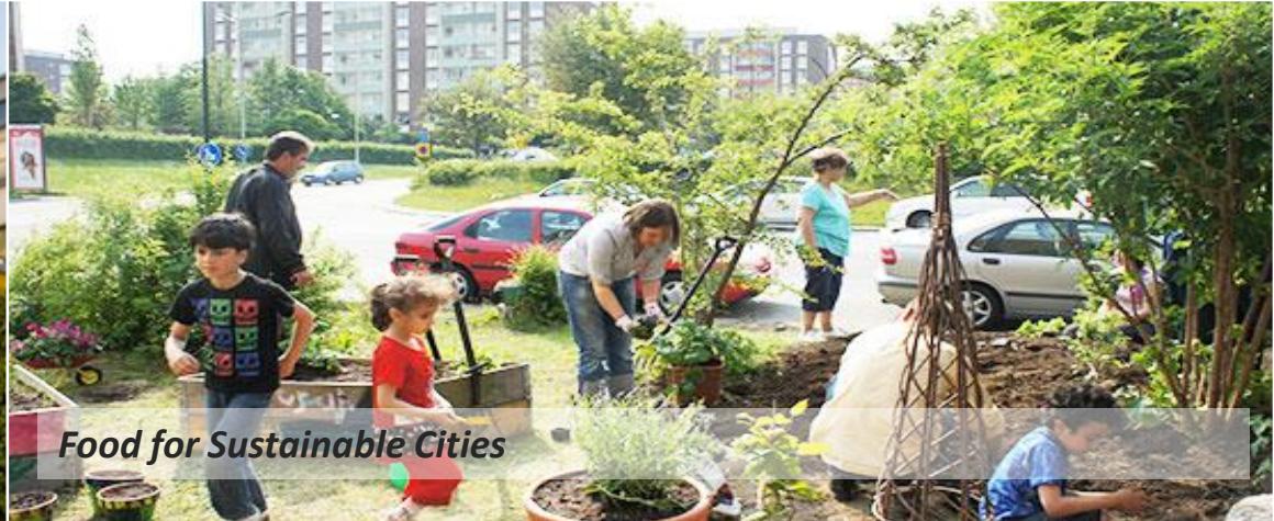
Food for Sustainable Cities