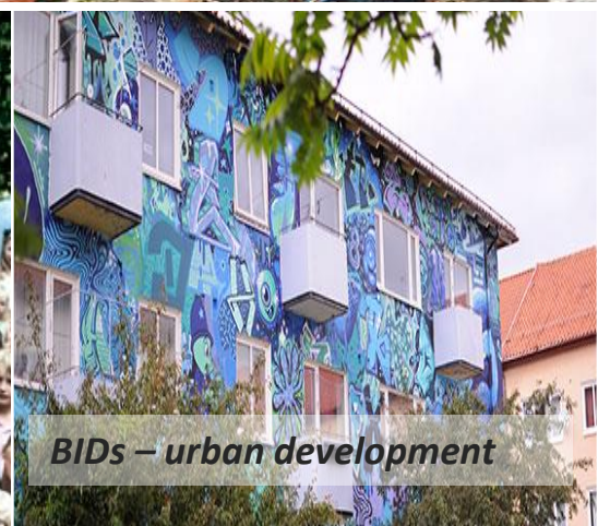
BIDs – urban development