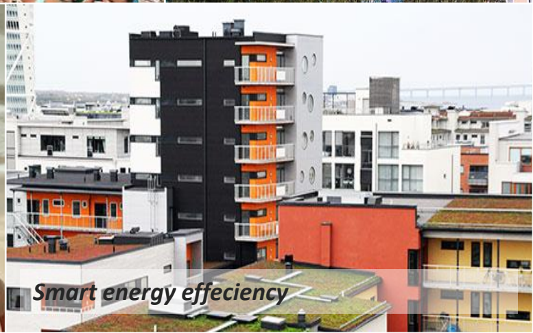
Smart energy efficiency