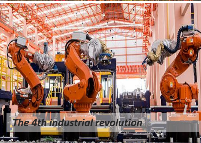
The 4th industrial revolution