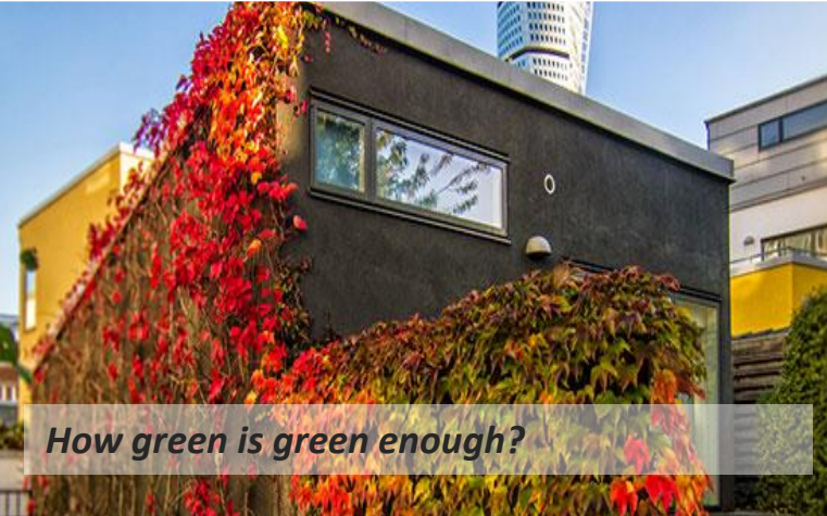
How green is green enough?