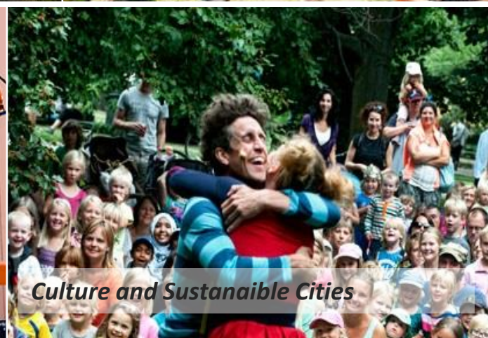
Culture and Sustainable Cities