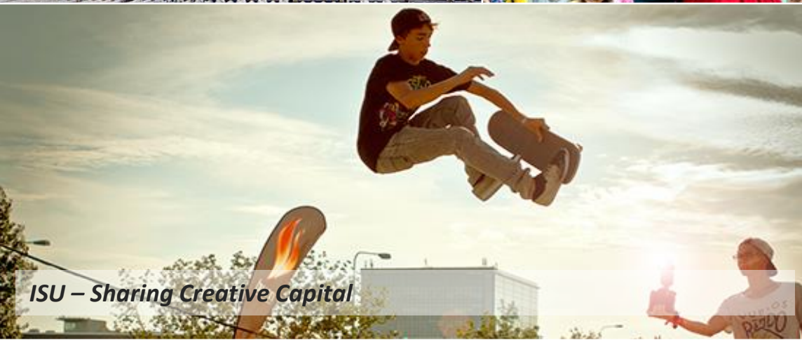
ISU – Sharing Creative Capital